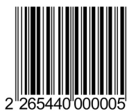
Variable Measure Number